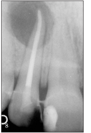
Figure 9: Four months later

Figure 8: Root canal treatment with ozone