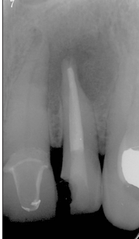
Figure 5: Six months later

Figure 6: Root canal treatment with ozone